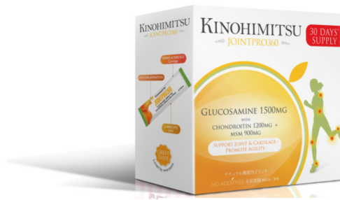
5g x 30 sachets